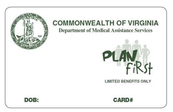
Plan First card