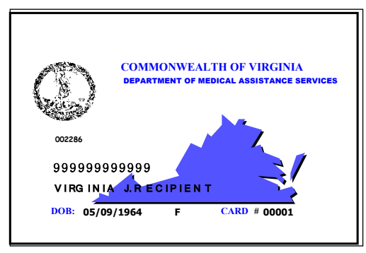
COV Medical Assistance card